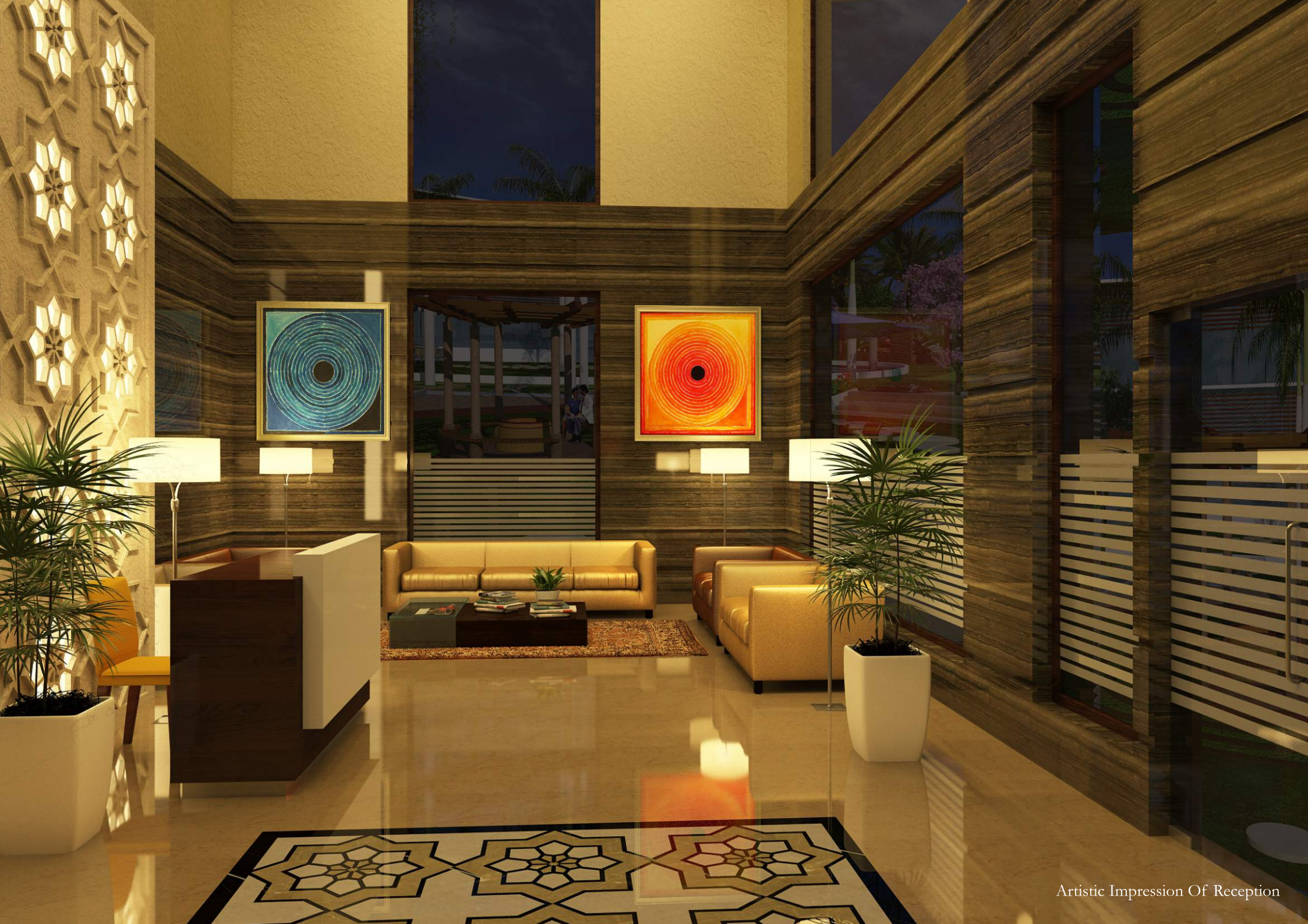
Artistic Impression Of Reception