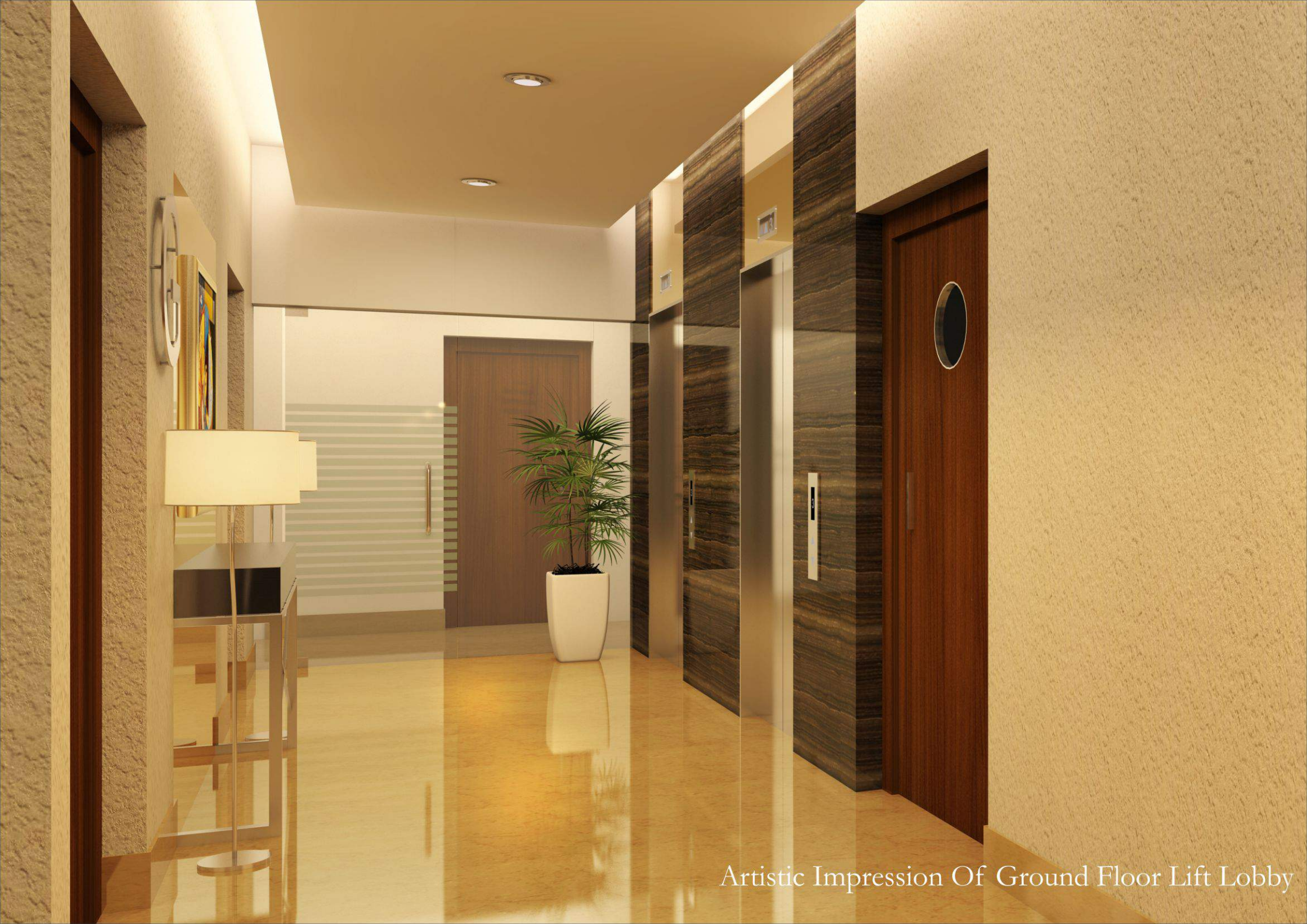
Artistic Impression Of Ground Floor Lift Lobby