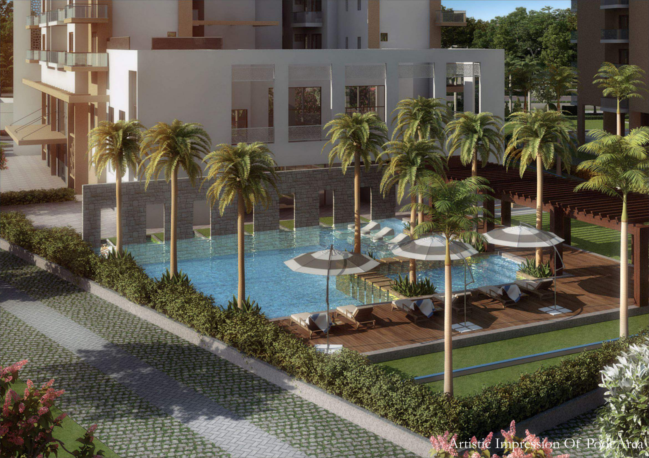
Artistic Impression Of Pool Area