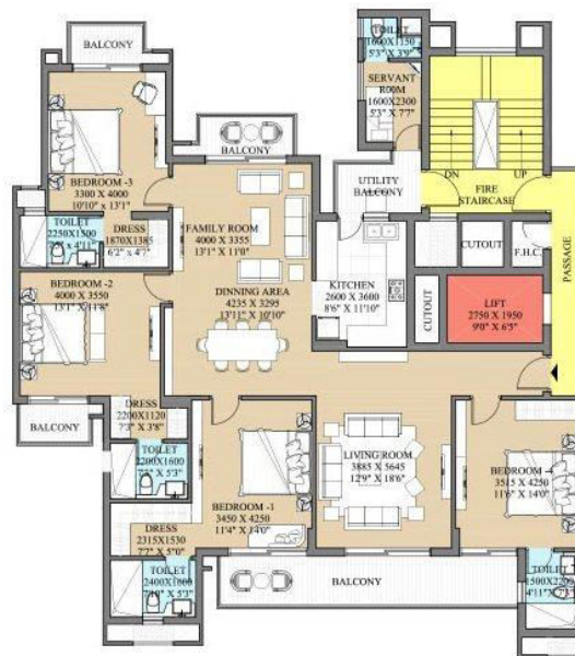
Typical Floor Unit- Type A