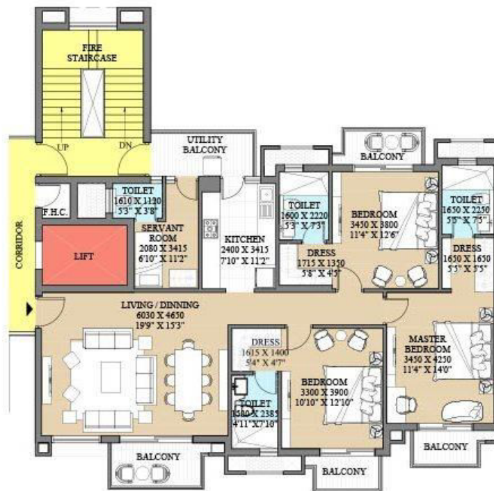
Typical Floor Unit- Type B

Type B: 3BHK + Servant, 1900 Sq. Ft., (Units Planned: 364)